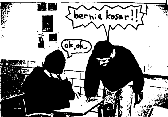
BELOW: The dubious quest commences.