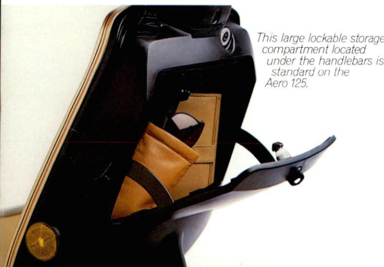
This large lockable storage compartment located under the handlebars is standard on the Aero 125.