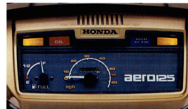
The Aero 125's full instrumentation includes speedometer, odometer, fuel gauge, and low-oil warning light.

The transmission is completely automatic. So's the choke. Starts at the push of a button. And there's automatic oil injection (so no pre-mixing oil and gas).